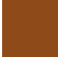
Corten - COR